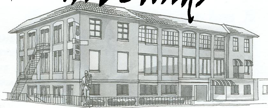
Home of the "Editorial Without Words" ~ Oasis of Evansville, Indiana

NONPROFIT ORG. U.S. POSTAGE PAID Evansville, Indiana Permit No. 1167