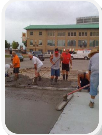
Volunteers helping with the parking lot resurfacing job.