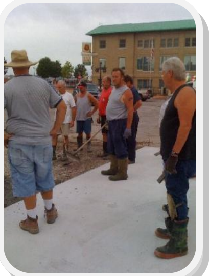
Playing in the MUD at 6:00 A.M. in the morning.