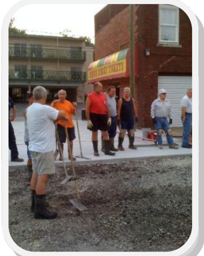
Great Job Volunteers!